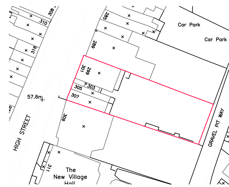
02 Block Plan Scale 1:1250