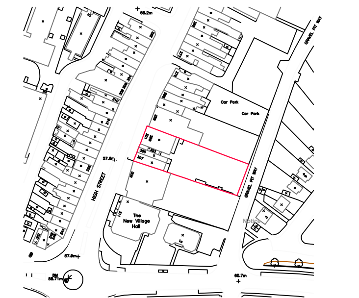
02 OS Map Scale 1:2500